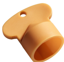
Cartridge S 25