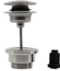
Pop-up valve Push Open