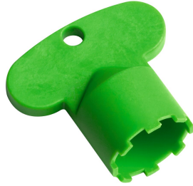
Service key Neoperl © Caché ©, TJ, 18 mm, green