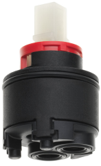
Cartridge M 35 OP