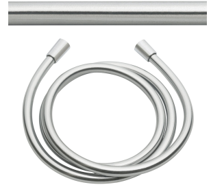
SHOWERCULTURE Shower hose