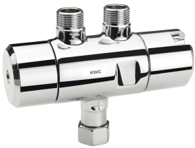
PURETHERM under-table thermostat