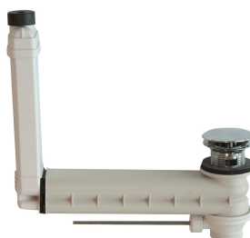
Drain and overflow set