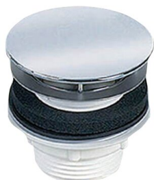
Dome waste valve