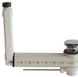
Drain and overflow set