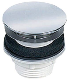
Dome waste valve