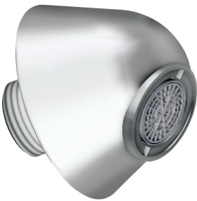
Wall outlet, DN 15 2000107291 ZTAPS0004