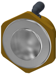
Remote operation valve 2000104780 EFLSY0027