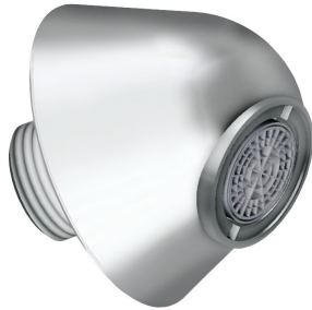
Wall outlet, DN 15