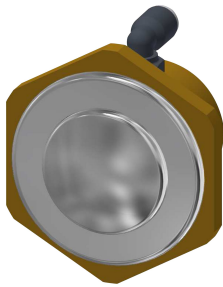
Remote operation valve 2000104780 EFLSY0027