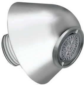
Wall outlet, DN 15 2000107291 ZTAPS0004