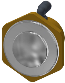
Remote operation valve