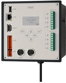
ECC2 function controller