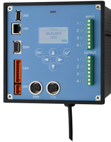
ECC2 function controller