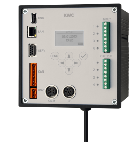
ECC2 function controller