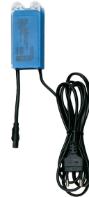
Power supply unit