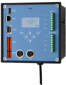
ECC2 function controller