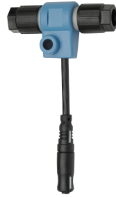
Electrical T junction