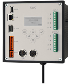
ECC2 function controller