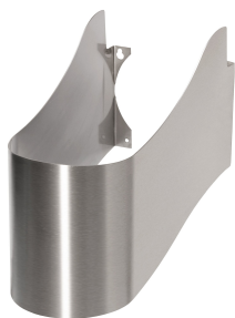
SIRIUS siphon cover