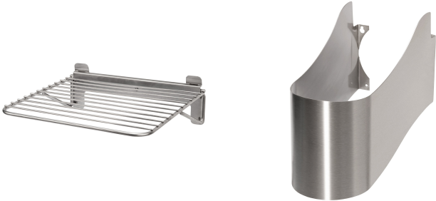
SIRIUS bucket grating

Modell-Linie: SIRIUS | SIRW511 Utility sinks | Cleaners sinks