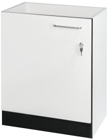
Cabinet for installation under the tabletop