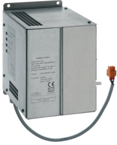
Uninterruptible power supply