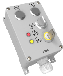
Operation box for ECC2 function controller