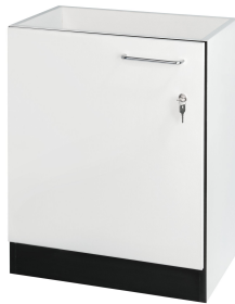
Cabinet for installation under the tabletop