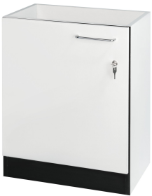
Cabinet for installation under the tabletop