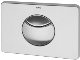
Flushing plate with 2 buttons for wall-installation cistern 2000067493 AQUA555