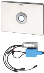
AQUATIMER - A3000 open electronic WC controller for cistern 2030021142 AT300051