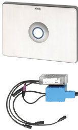
AQUATIMER - A3000 open electronic WC controller for cistern 2030021142 AT300051