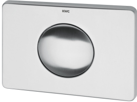
Flushing plate with 1 button for wall-installation cistern 2000067429 AQUA557

Modell-Linie: AQUAFIX | AQFX0006 Installation frames | Installation units wc