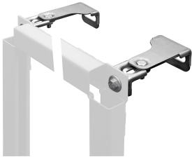
AQUAFIX wall bracket 2000100867 ZCMPX140