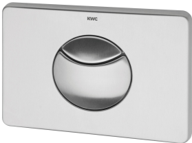
Flushing plate with 2 buttons for wall-installation cistern 2000067493 AQUA555