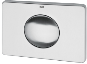
Flushing plate with 1 button for wall-installation cistern

Modell-Linie: AQUAFIX | AQFX0007 Installation frames | Installation units wc