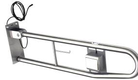
CONTINA foldable grab rail with electronic flush button