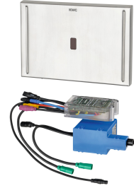
EXOS - A3000 open electronic WC controller for cistern