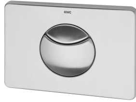
Flushing plate with 2 buttons for wall-installation cistern