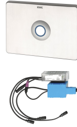
AQUATIMER - A3000 open electronic WC controller for cistern