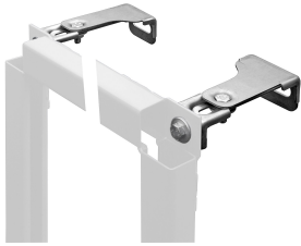
AQUAFIX wall bracket