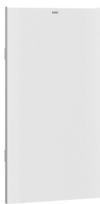
EXOS. front with white safety glass panel