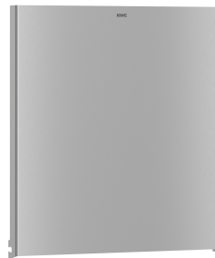
EXOS. stainless steel front paper towel dispenser for recessed mounting