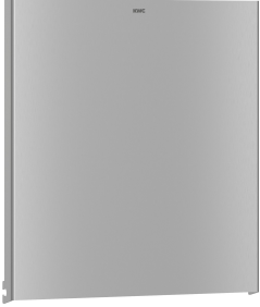
EXOS. stainless steel front paper towel dispenser for recessed mounting

Modell-Linie: EXOS | EXOS600B Accessories | Paper towel dispensers