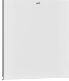
EXOS. front with white safety glass panel