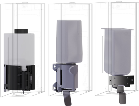
EXOS. conversion kit for EXOS. soap dispenser