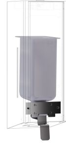
EXOS. conversion kit for liquid soap dispenser