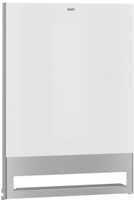
EXOS. front with white safety glass panel