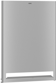
EXOS. stainless steel front for paper towel dispenser

Modell-Linie: EXOS | EXOS637B Accessories | Paper towel dispensers