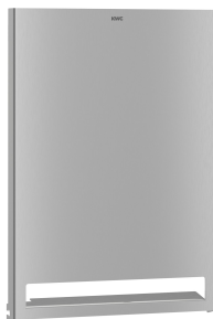
EXOS. stainless steel front for paper towel dispenser