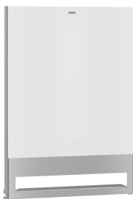
EXOS. front with white safety glass panel