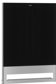
EXOS. front with black safety glass panel