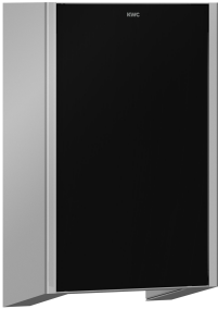
EXOS. front cover with black safety glass panel