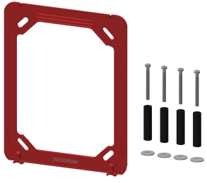
Cover plate stainless steel