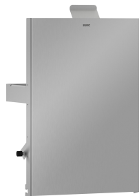
EXOS. stainless steel front for EXOS. hygiene waste bin for wall and recessed mounting

Modell-Linie: EXOS | EXOS611B Accessories | Hygiene bins