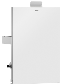
EXOS. front with white safety glass panel