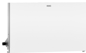
EXOS. front with white safety glass panel