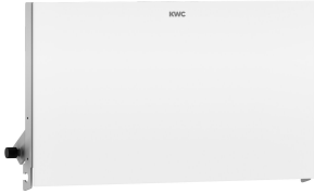
EXOS. front with black safety glass panel