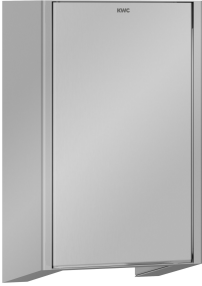
Interchangeable front panels for EXOS. hand dryers