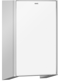
EXOS. front cover with white safety glass panel