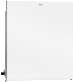
EXOS. front with white safety glass panel