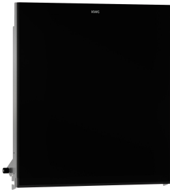
EXOS. front with black safety glass panel

Modell-Linie: EXOS | EXOS600EX Accessories | Paper towel dispensers