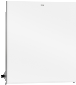
EXOS. front with white safety glass panel 2030034672 ZEXOS600EW