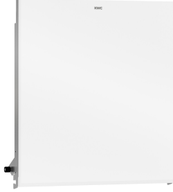
EXOS. front with white safety glass panel