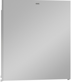
EXOS. stainless steel front for paper towel dispenser for recessed mounting

Modell-Linie: EXOS | EXOS600EB Accessories | Paper towel dispensers