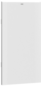
EXOS. front with white safety glass panel 2030025234 ZEXOS605W