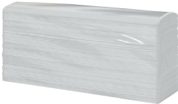
Paper towels 2030072378 FH70P