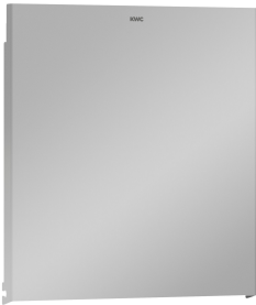
EXOS. stainless steel front for paper towel dispenser for recessed mounting 2030034647 ZEXOS600E

Modell-Linie: EXOS | EXOS602EB Accessories | Combinations