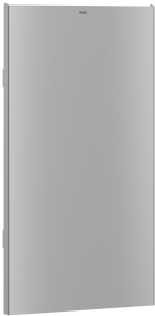
EXOS. stainless steel front for waste bin for wall and recessed mounting 2030022930 ZEXOS605