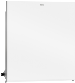
EXOS. front with white safety glass panel 2030034672 ZEXOS600EW