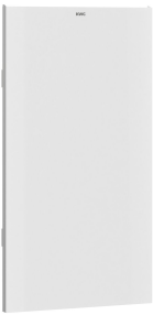
EXOS. stainless steel front for waste bin for wall and recessed mounting