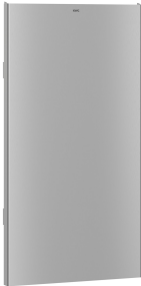
EXOS. stainless steel front for waste bin for wall and recessed mounting

Modell-Linie: EXOS | EXOS605EB Accessories | Waste bins