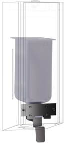
EXOS. conversion kit for liquid soap dispenser