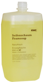
Foam soap cartridge 2030058766 EXINX616FP