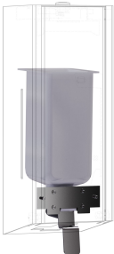
EXOS. conversion kit for liquid soap dispenser 2030022956 ZEXOS618K