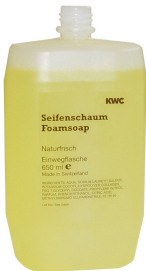
Foam soap cartridge 2030058766 EXINX616FP