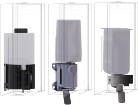
EXOS. conversion kit for EXOS. soap dispenser 2030022954 ZEXOS625K