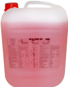
Liquid soap 2000057168 SO10L