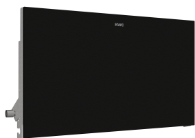
EXOS. front with black safety glass panel

Modell-Linie: EXOS | EXOS676EX Accessories | WC-roll holders