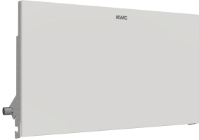
EXOS. front with black safety glass panel