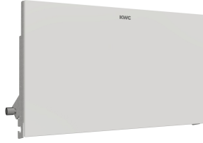
EXOS. front with white safety glass panel