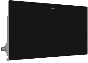
EXOS. front with black safety glass panel