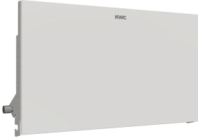
EXOS. front with black safety glass panel