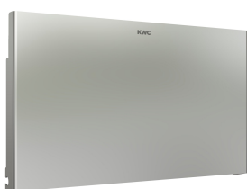
EXOS. stainless steel front for EXOS. double toilet roll holder for recessed mounting

Modell-Linie: EXOS | EXOS676EB Accessories | WC-roll holders