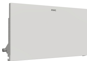
EXOS. front with white safety glass panel