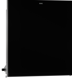
EXOS. front with black safety glass panel