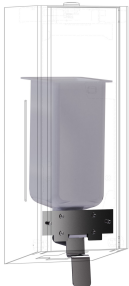
EXOS. conversion kit for liquid soap dispenser