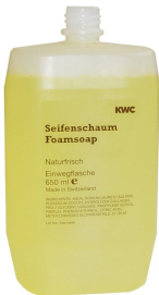
Foam soap cartridge