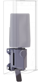
EXOS. conversion kit for foam soap dispenser