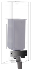
EXOS. conversion kit for liquid soap dispenser