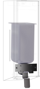
EXOS. conversion kit for liquid soap dispenser