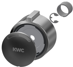
Handle push cap