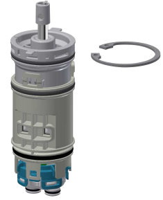
FRAMIC self-closing mixing cartridge